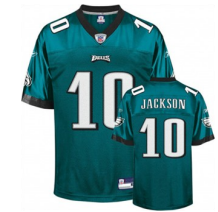
#10 Desean Jackson Home Green Jersey