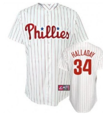
#34 Roy Halladay Home White Jersey

The class of 2013 is holding a raffle, for a chance to win one of the following sports jerseys, just in time for the holidays.