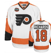
#18 Mike Richards 2010 Winter Classic Jersey